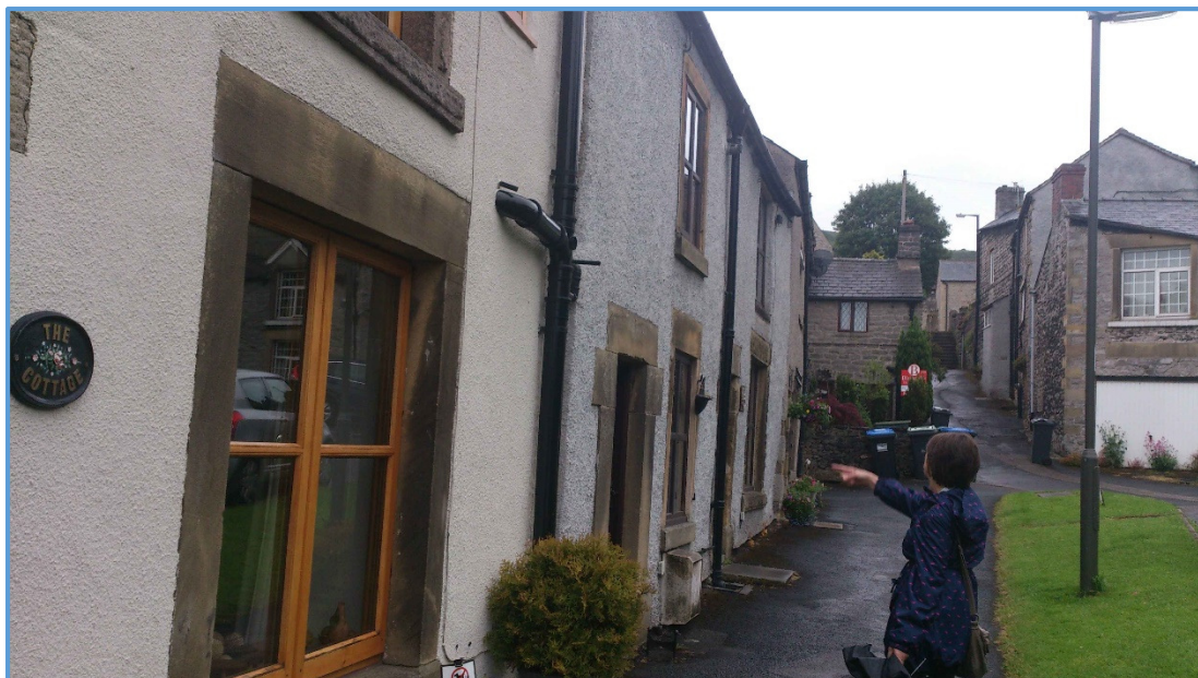
Water Lane, Bradwell