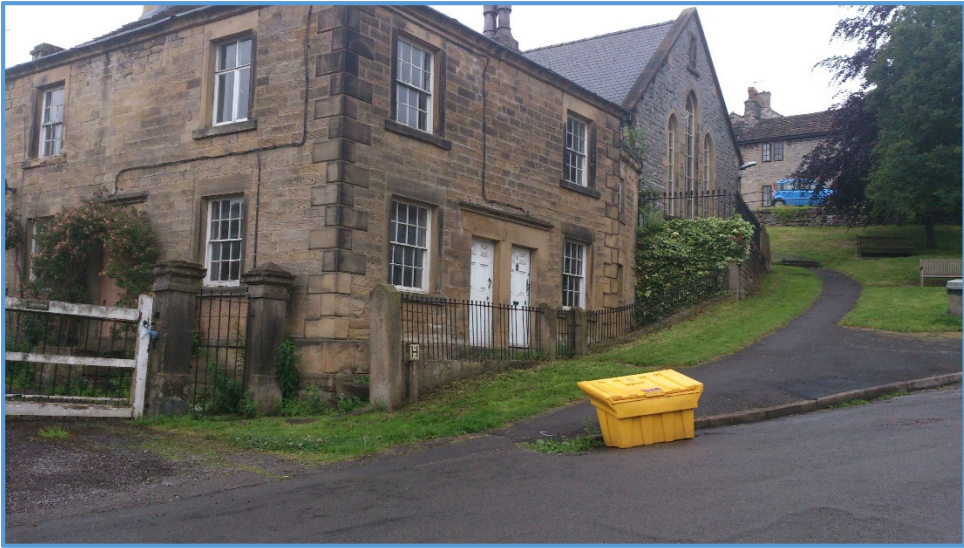
The Church and School at Yard Head, Bradwell