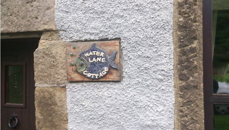
House sign, Water Lane, Bradwell