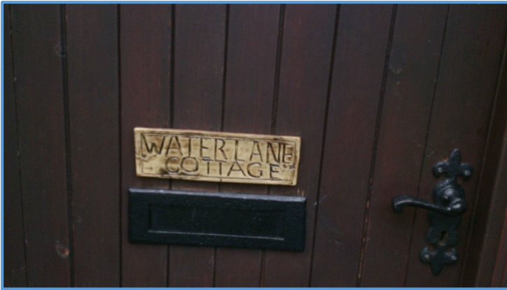
House sign, Water Lane, Bradwell