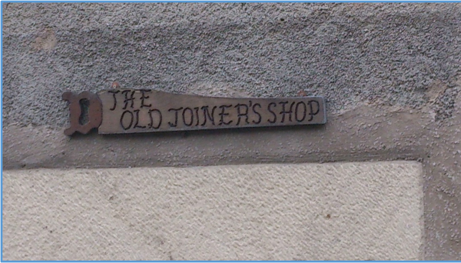
The Old Joiner's Shop, Yard Head, Bradwell