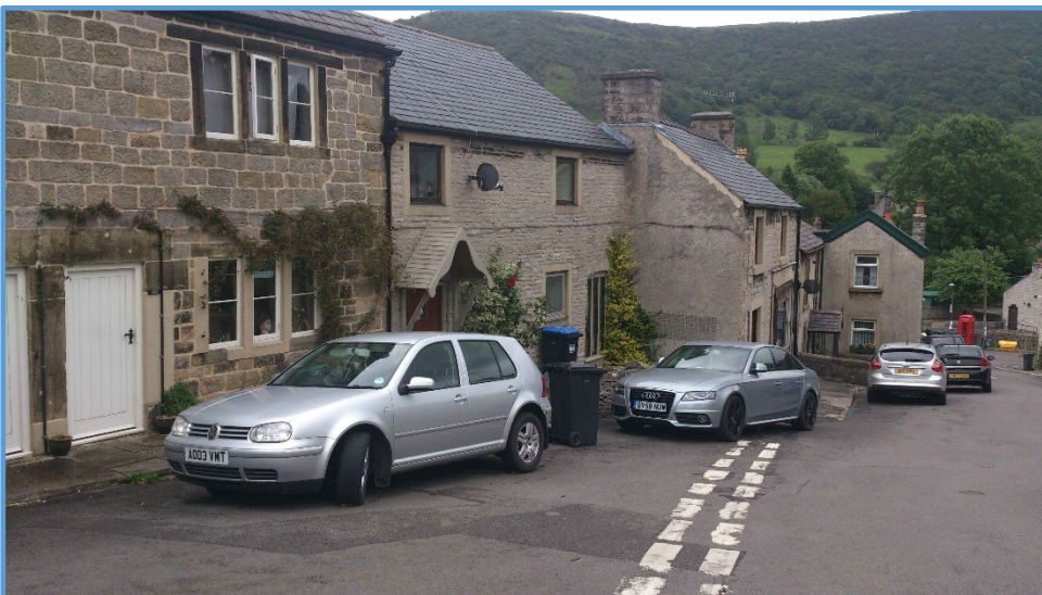
North side of Yard Head, Bradwell