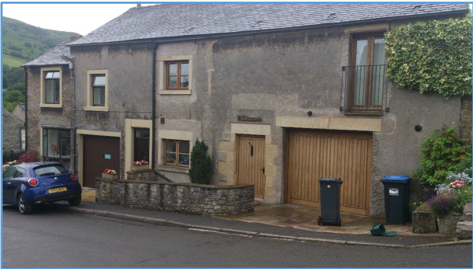
The Old Joiner's Shop, Yard Head, Bradwell