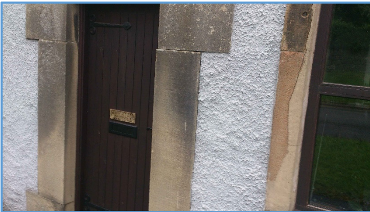
Water Lane, Bradwell