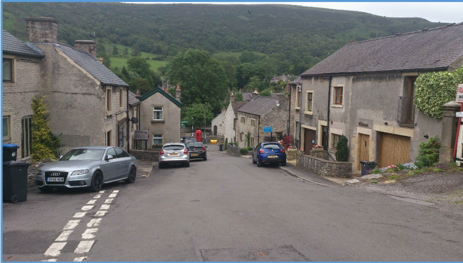
Looking East down Yard Head, Bradwell