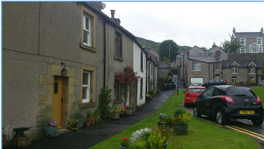
Water Lane, Bradwell