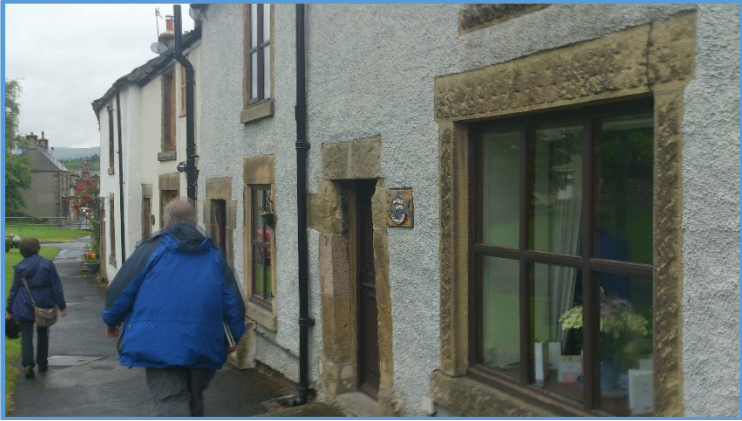
Water Lane, Bradwell