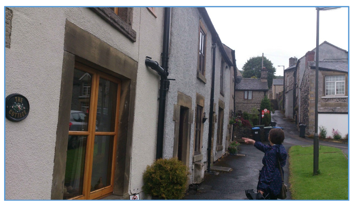
Water Lane, Bradwell