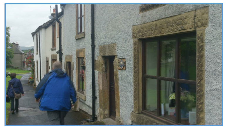
Water Lane, Bradwell