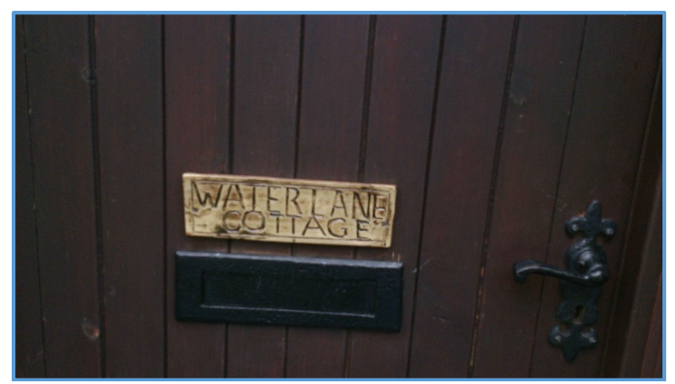
House sign, Water Lane, Bradwell