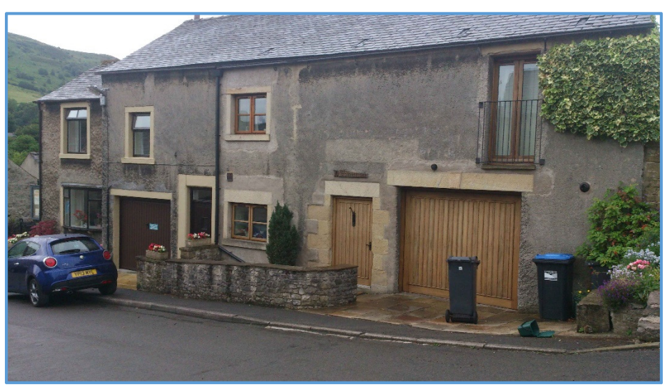
The Old Joiner's Shop, Yard Head, Bradwell