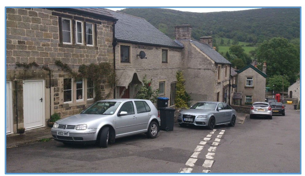
North side of Yard Head, Bradwell