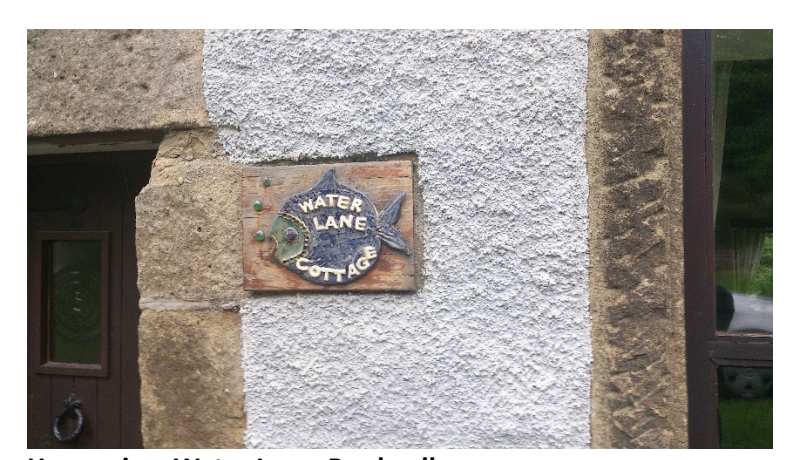
House sign, Water Lane, Bradwell