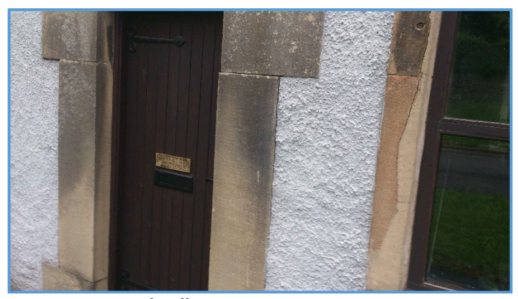
Water Lane, Bradwell