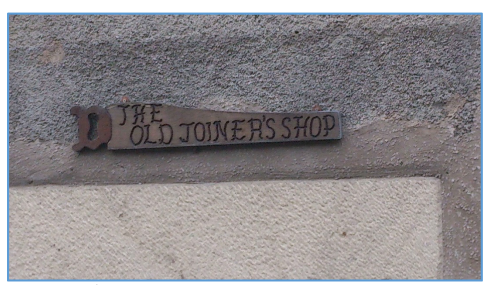
The Old Joiner's Shop, Yard Head, Bradwell