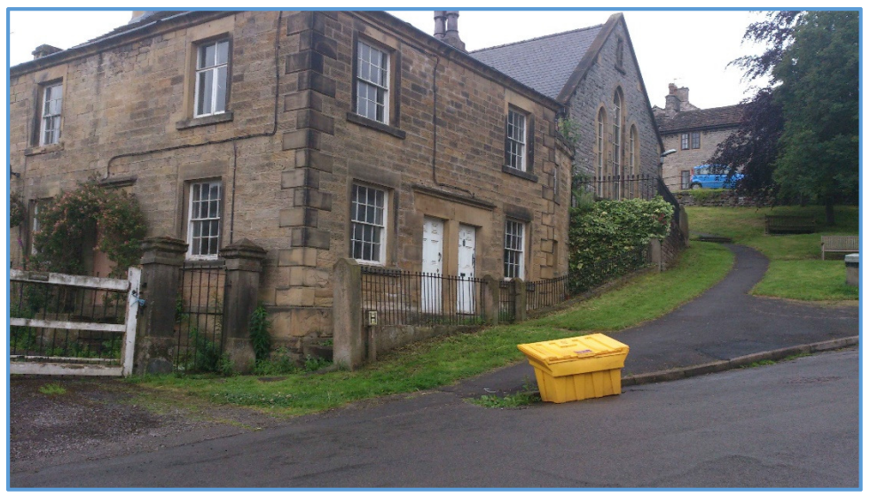
The Church and School at Yard Head, Bradwell