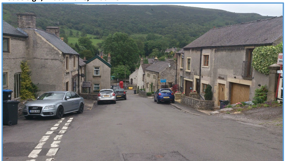
Looking East down Yard Head, Bradwell